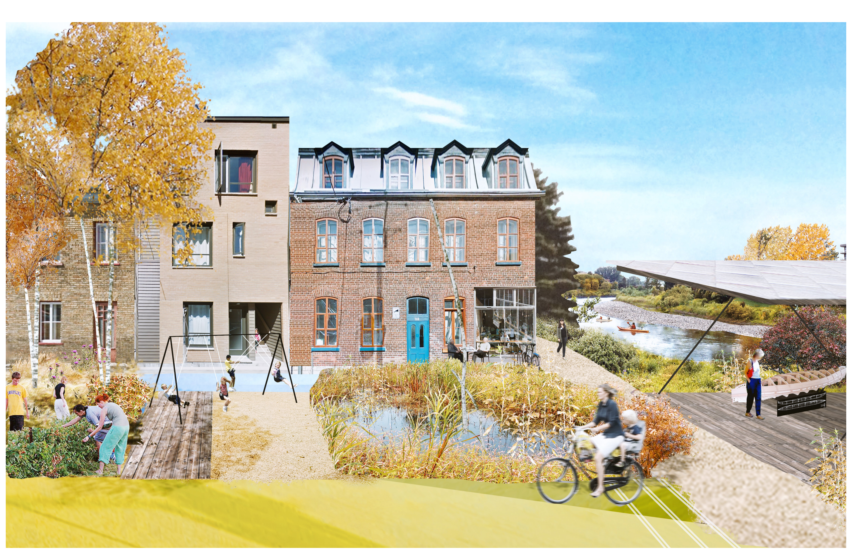
RIVER TERMINUS OF HEADWATER LOT AT POINTE-AUX-LIÈVRES