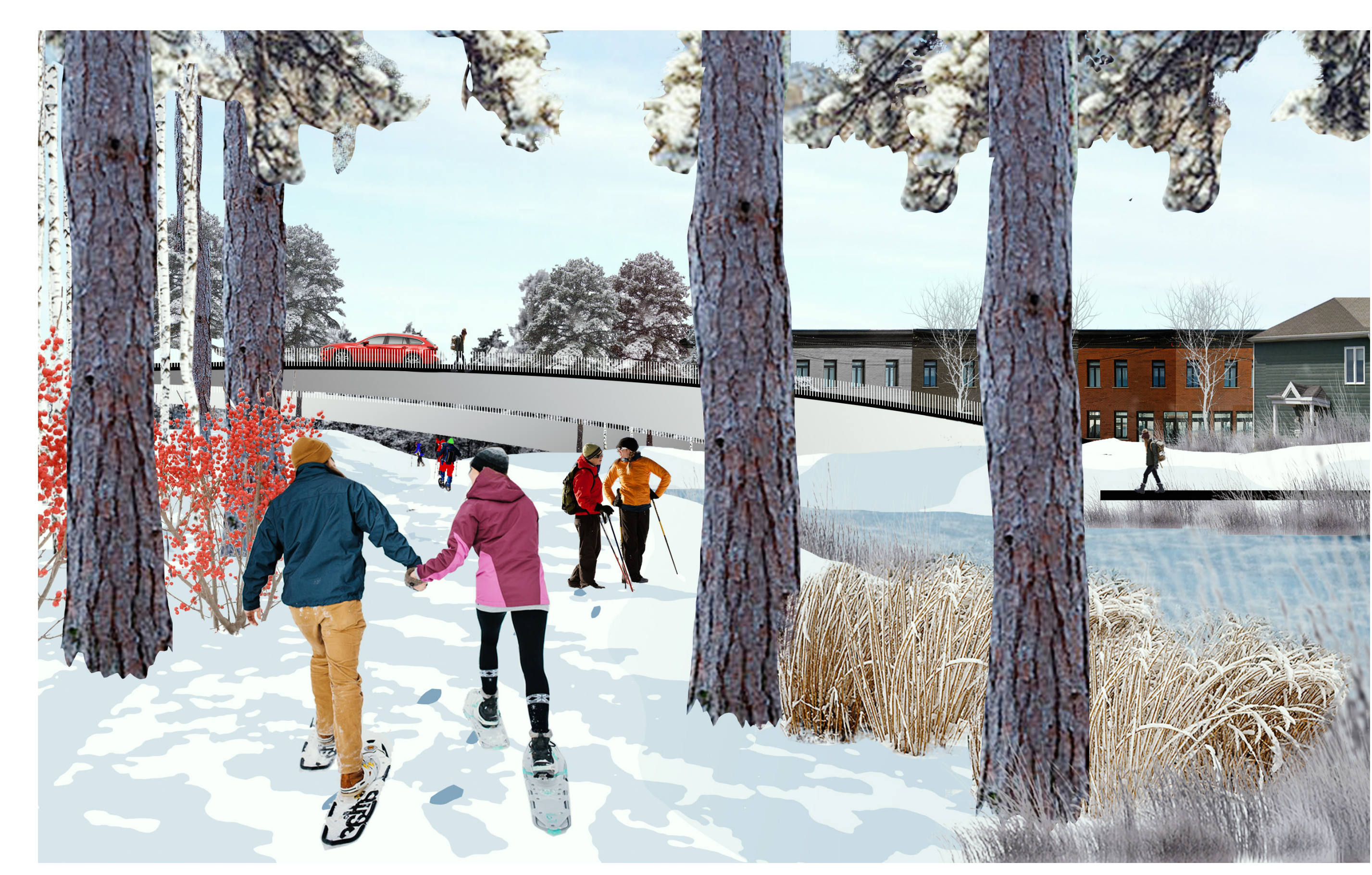
BEAUPORT RIVER AT PROPOSED "BOULEVARD" FÉLIX LECLERC