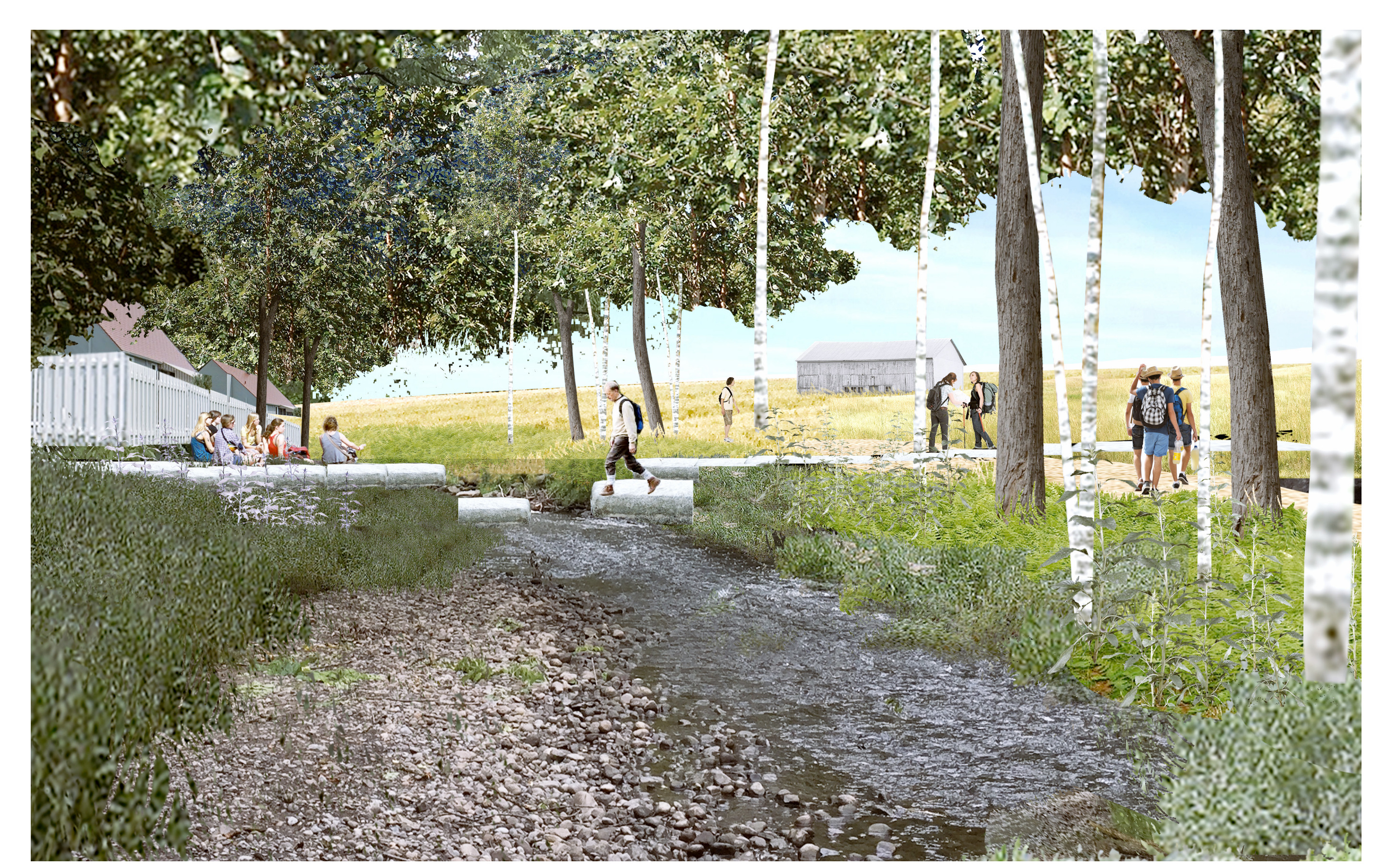
HEADWATER LOT AT AGRICULTURAL TRAIL