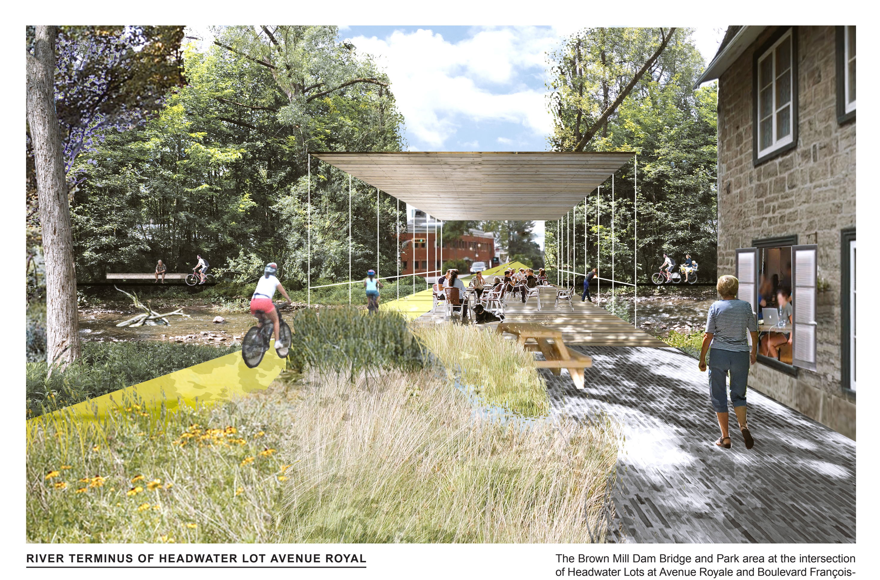
RIVER TERMINUS OF HEADWATER LOT AVENUE ROYAL