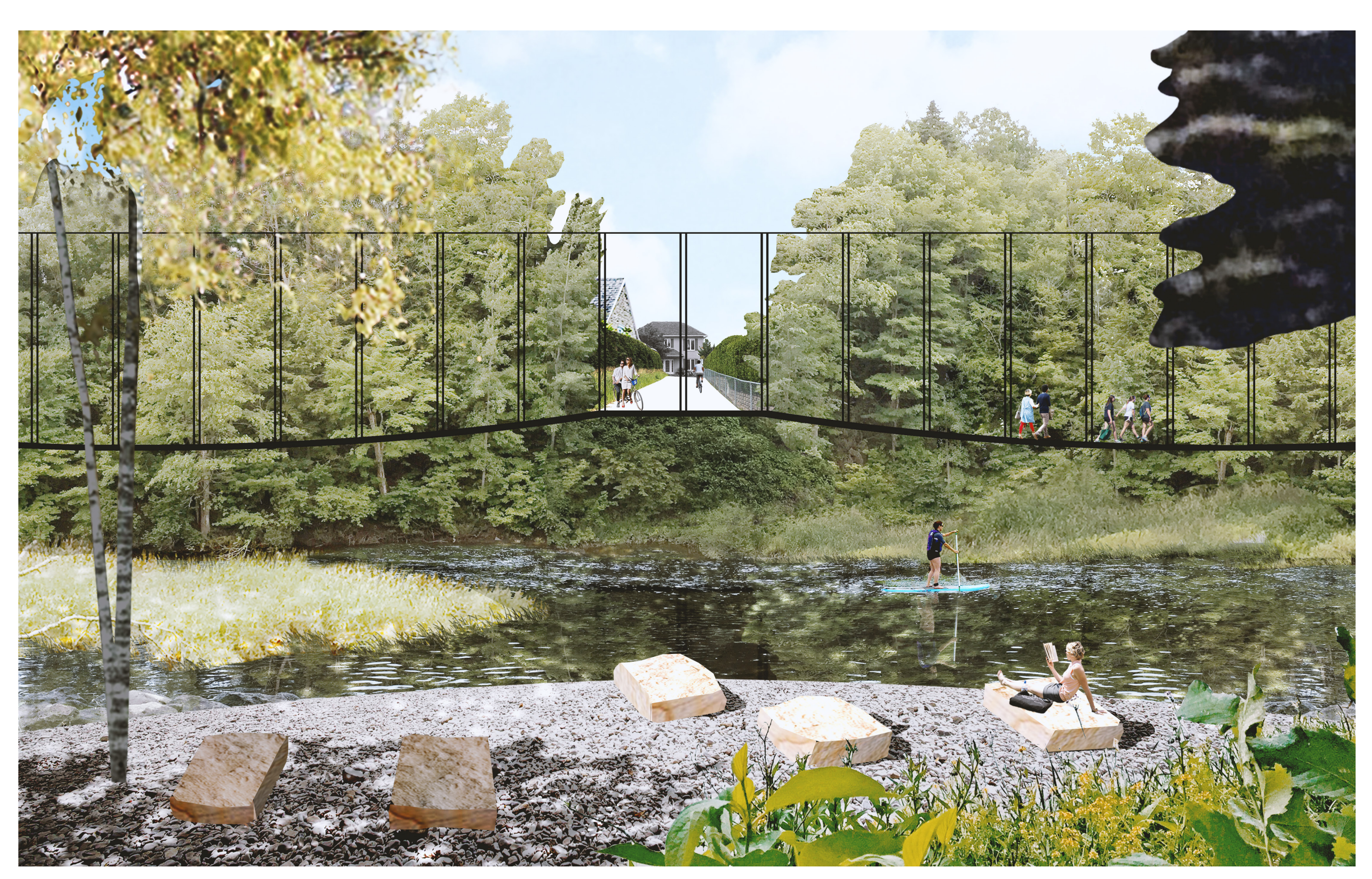
RIVER TERMINUS OF HEADWATER LOT NEAR PARK CHAUVEAU

De Laval is a space for cultural activity. It invited people to stay and enjoy the sounds of the cascades.